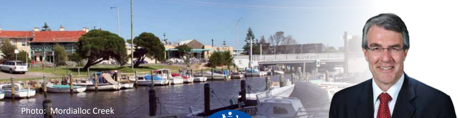
Photo: Mordialloc Creek