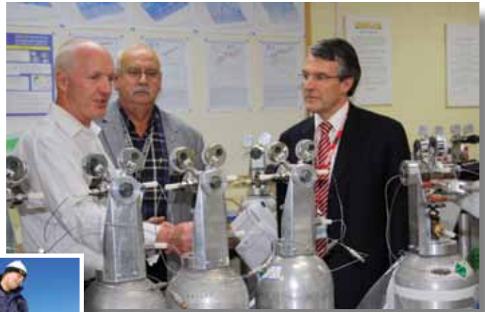
Mark Dreyfus MP with atmospheric scientists at the CSIRO in Aspendale