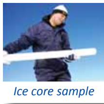
Ice core sample

One way of measuring these changes is for scientists to take a trip to Antarctica and drill down many metres to take an "ice core" sample (pictured). The ice has trapped air from many centuries ago which is tested and measured against greenhouse gas levels of today.