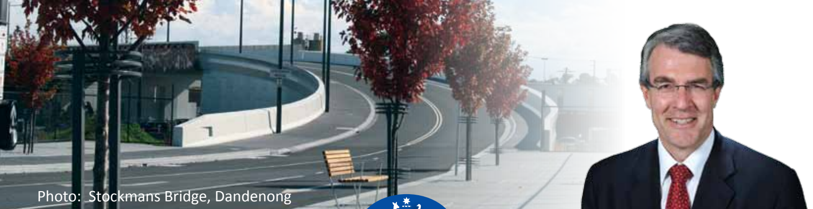
Photo: Stockmans Bridge, Dandenong