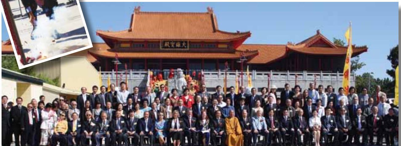
Mark Dreyfus MP with guests at the Bright Moon Buddhist Society celebrations