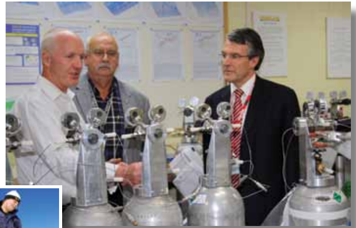
Mark Dreyfus MP with atmospheric scientists at the CSIRO in Aspendale