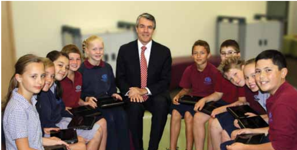
Mark Dreyfus MP with Rowellyn Park Primary School Leaders 2011

I officially opened the $3.2 million educational centre at Rowellyn Park Primary School in Carrum Downs in March. The Centre was funded from the Federal Government's Building the Education Revolution (BER) program.