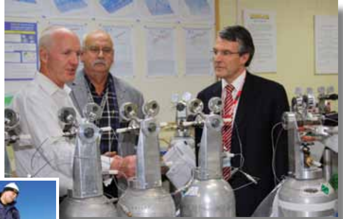
Mark Dreyfus MP with atmospheric scientists at the CSIRO in Aspendale